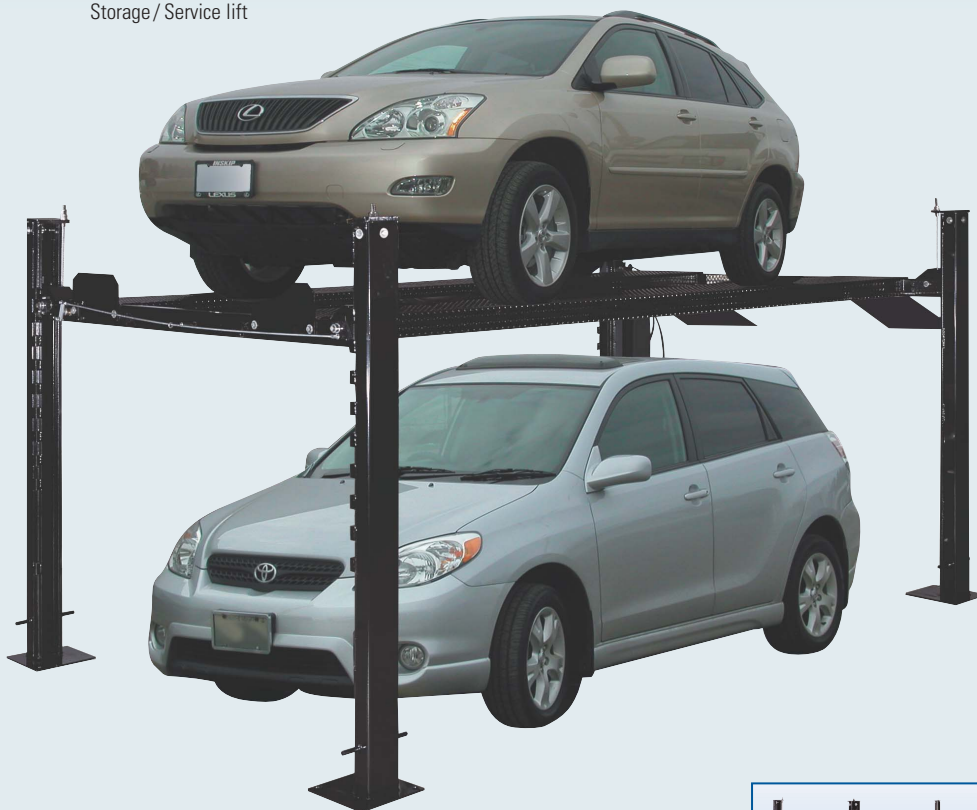
FP7K Storage / Service lift

7,000 lb./ 9,000 lb. capacity and large 3" cylinder, one-piece diamond-plate runways and scratch-resistant powder coat paint.